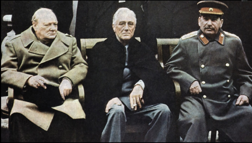
The infernal Trinity The A=C that won the world for socialism.